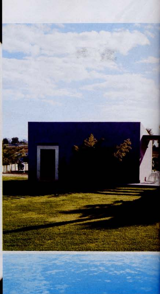
Sicily's Modern Classics Gnocchi with Gorgonzola sauce and cherry-tomato coulis, left, at Caol Ishka's restaurant, Zafferano Bistrot. Above: Poolside at Caol Ishka. Opposite: The wine-tasting room at COS.